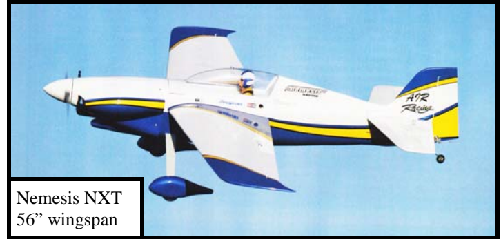
Nemesis NXT 56" wingspan

Glow engines are being replaced by electric, especially in the smaller sizes and, as we all know, batteries are getting more powerful and losing weight, so there is a natural movement to larger planes as time goes on. The cost of the larger batteries has been somewhat of a problem previously, but these costs are already starting