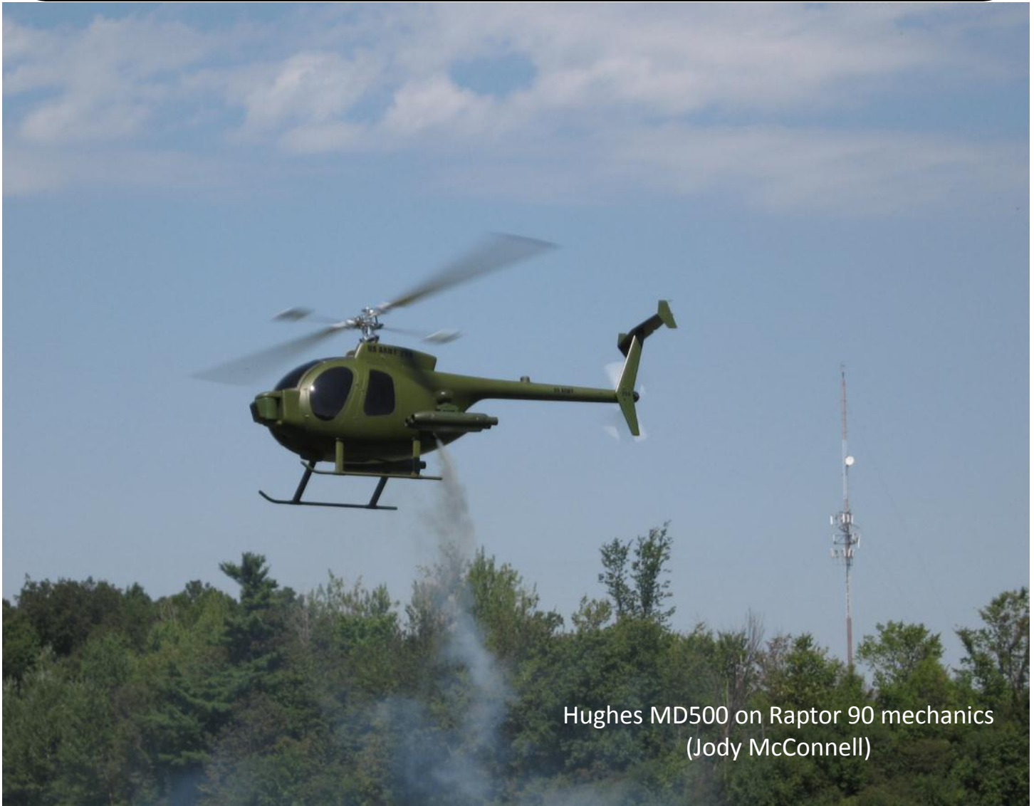
Hughes MD500 on Raptor 90 mechanics (Jody McConnell)