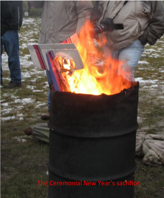
The Ceremonial New Year's sacrifice

So folks, it turned out to be a truly great day, everyone had loads of fun and it was great to see so many members out having fun and to see everyone shaking hands for the New Year. Here's hoping that this is a great omen for us all and for the club.....Happy New Year, everyone.