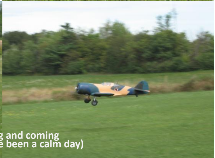
Gotcha going and coming (hmm—must have been a calm day)