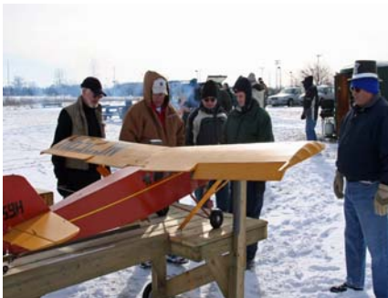
The sole entrant and pit helpers.