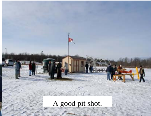
A good pit shot.