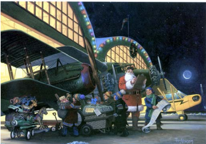
Old timer photos

The meeting was called shortly thereafter.